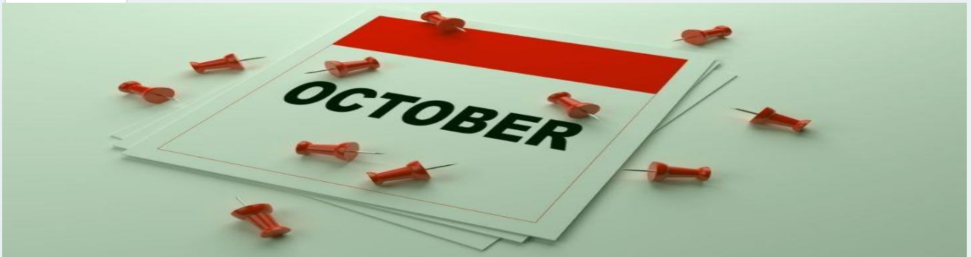
“A nod to Halloween in the past”

View About Us at: http://www.fremantle.bridge-club.org/