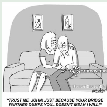
"TRUST ME, JOHN! JUST BECAUSE YOUR BRIDGE PARTNER DUMPS YOU...DOESN'T MEAN I WILL!"