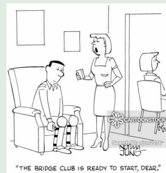
"THE BRIDGE CLUB IS READY TO START, DEAR."