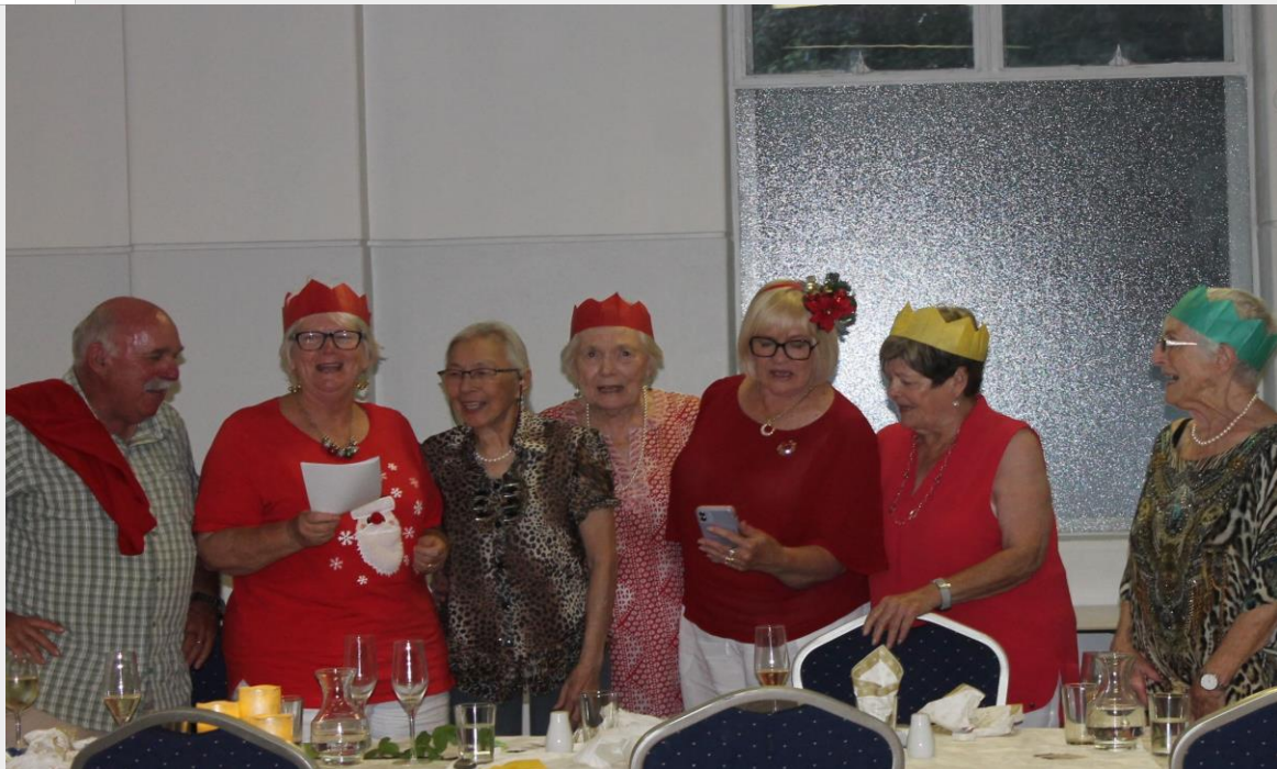
Winning Table Christmas Carollers

View About Us at: http://www.fremantle.bridge-club.org/